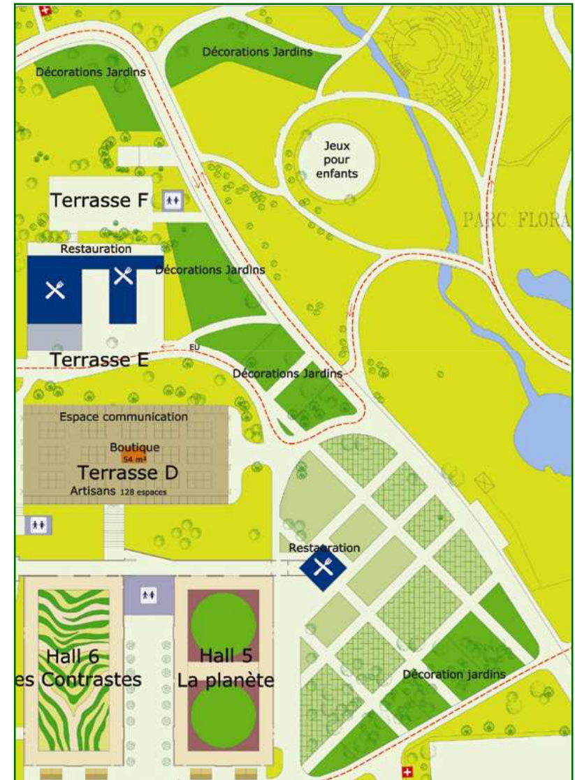
Partiel map of the site